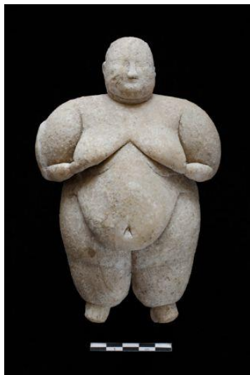
An 8,000-year-old statuette of what could be a fertility goddess unearthed at a Neolithic site in Turkey

The Venus of Willendorf is a 4.4-inch tall carving discovered in Willendorf, Austria. It is believed to have been crafted between 30,000 and 25,000 BCE, making it one of the world's oldest known works of art.